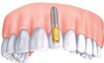
Crown centred on abutment